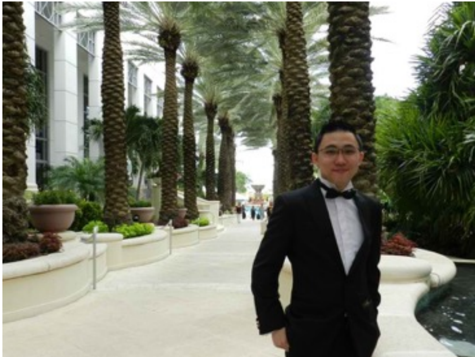
At Loews Miami Beach Hotel in Miami, Florida before our Awards Night in 2011