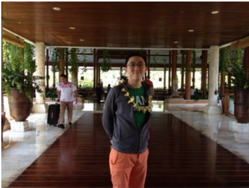
Upon arrival at Hotel Melia Bali in Nusa Dua, Bali in 2012